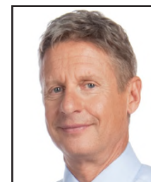
Gov. Gary Johnson