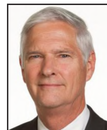
Judge Jim Gray

fitting with Columbus being such a big college town.